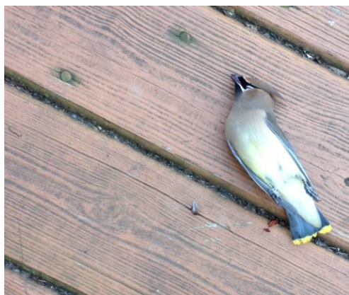
A Cedar Waxwing suffers a preventable fate